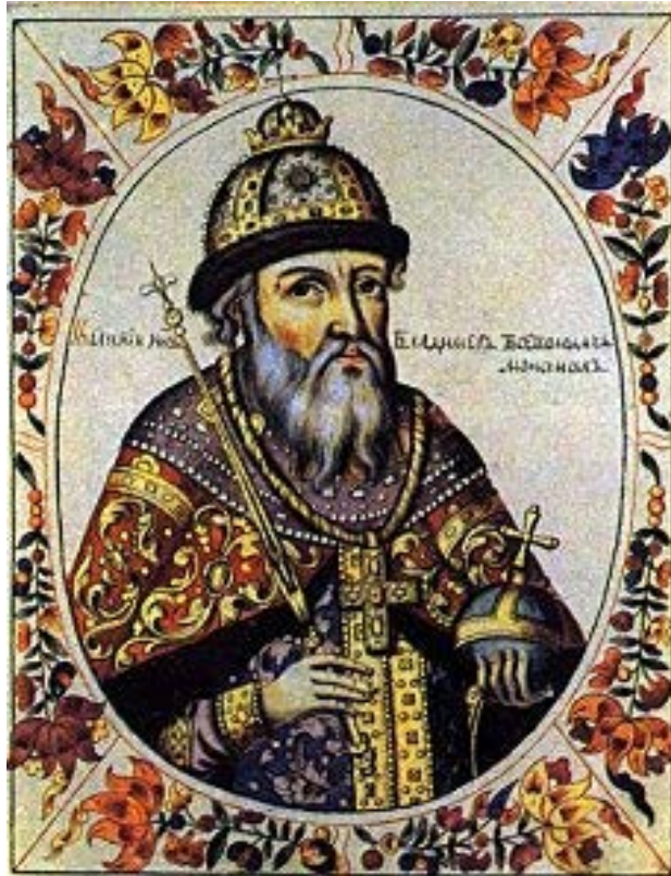
Vladimir 1 st , the Monomach 1052 – 1125 Grand Prince of Kiev and Prince of Smolensk.