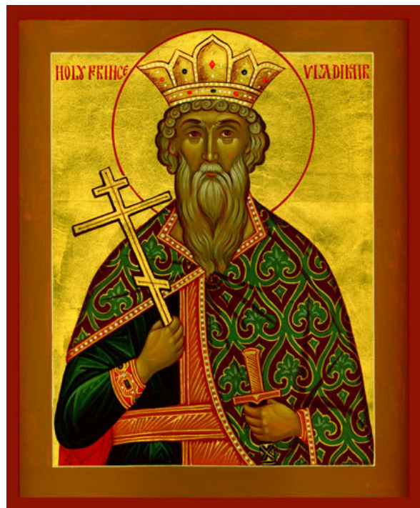
Saint Vladimir Grand Prince of Kiev 958 – 1015. He is the Grand Prince who Christianised Russia.