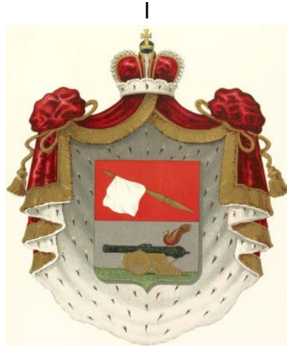
Tatistcheff's coats of arms.

Under the reign of Peter the Great, Russia becomes more and more "Occidental" and are appearing the coats of arms.