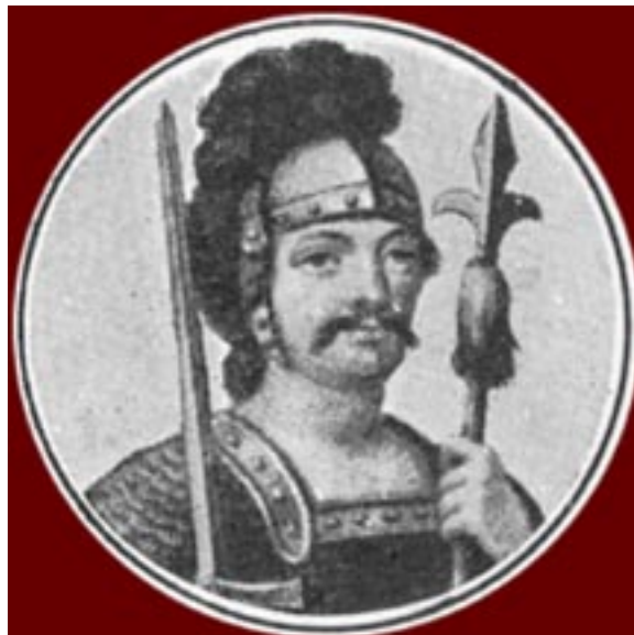
Igor Grand Prince of Kiev 878 – 945 The country’s capital city moves: and from Novgorod it settles in Kiev.