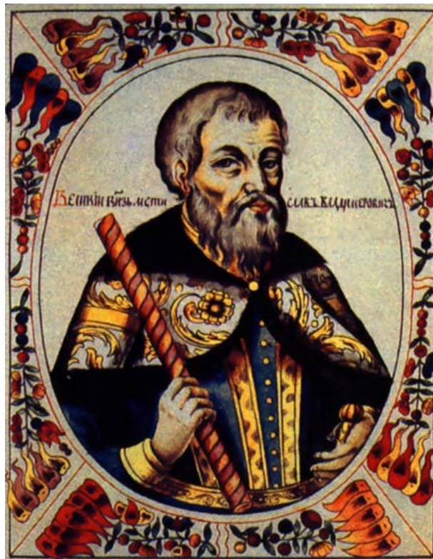
Mstislav 1 st Grand Prince of Kiev and of Novgorod 1076 – 1132.