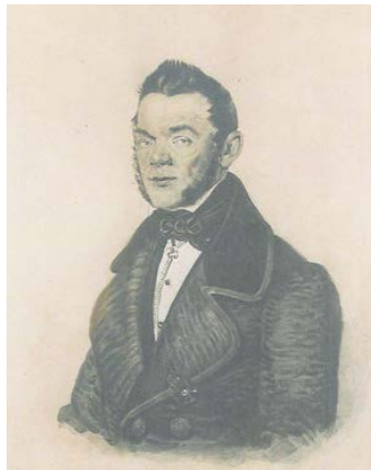
Nikita Tatistcheff 1796 – 1852