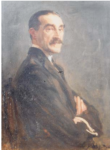
Nikita Tatistcheff – the last Governor of Moscow 1879 – 1948