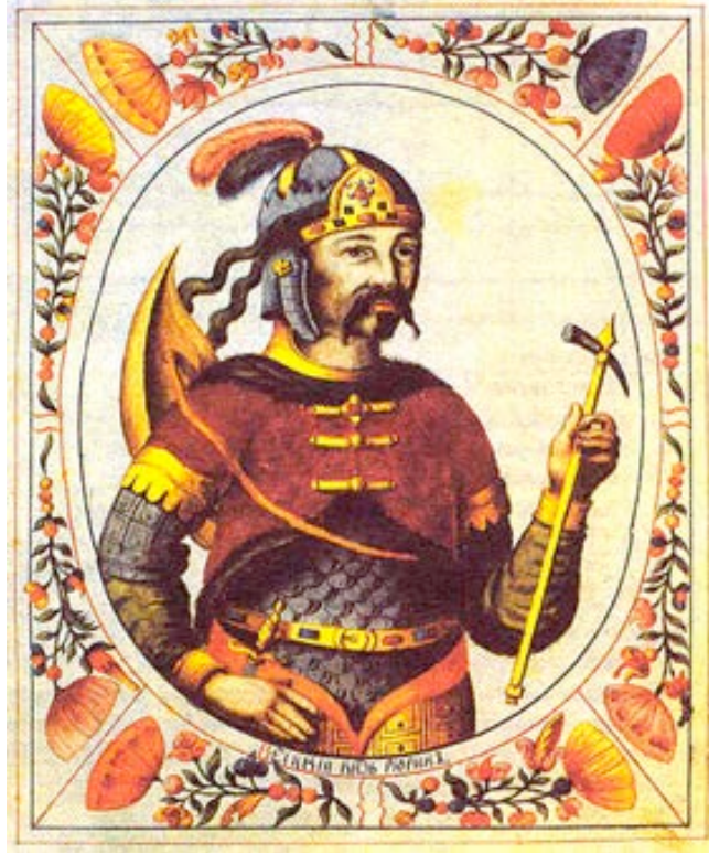
Rurik, the first “Tsar” of Russia 830 – 879 Grand Prince of Novgorod, the town he has founded.