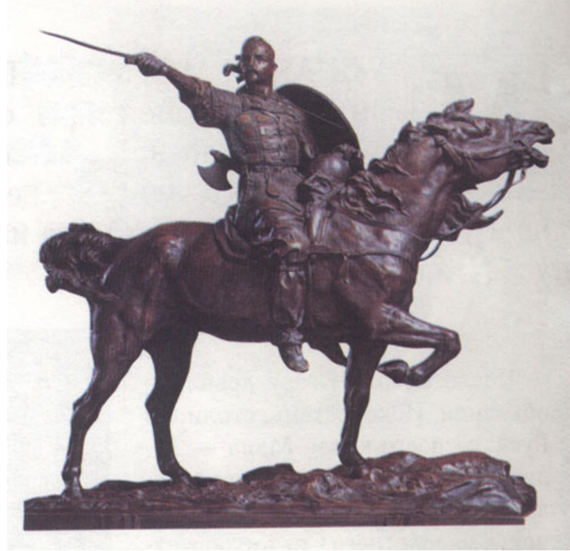
On the left : Saint Olga 890 – 960, Regent and Sviatoslav’s mother, the future Grand Prince of Kiev. On the right her son: Sviatoslav 942 – 972 Grand Prince of Kiev.